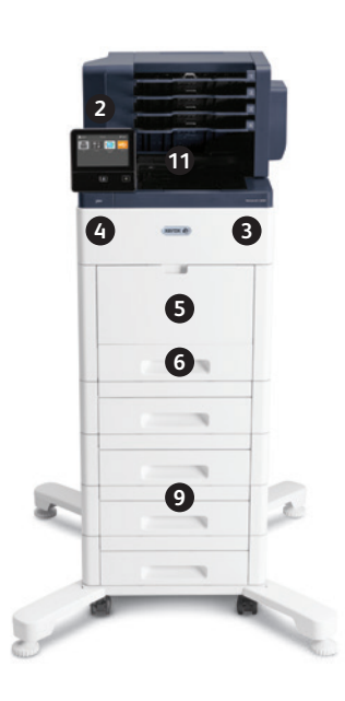
Xerox® VersaLink® C600 Color Printer